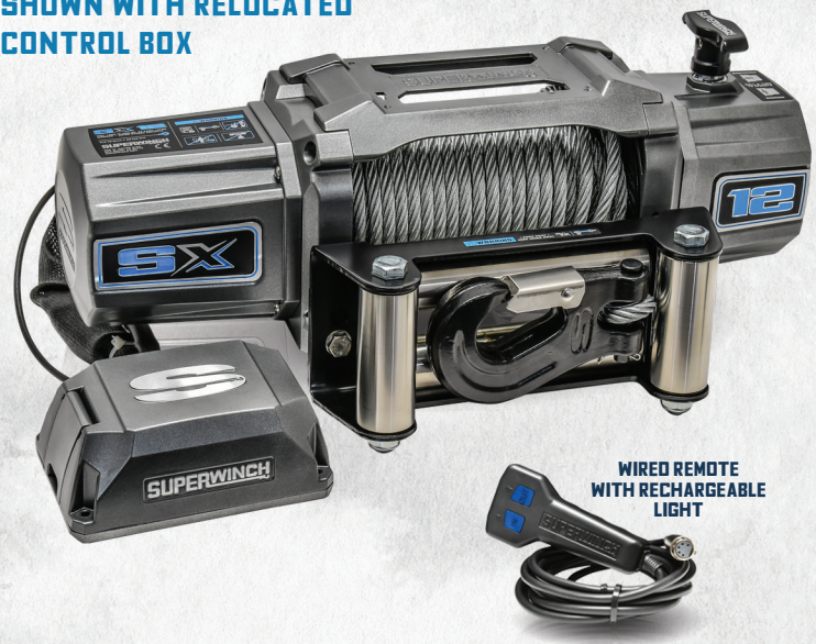
WIRED REMOTE WITH RECHARGEABLE LIGHT